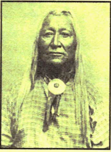
Chief Washakie Shoshone